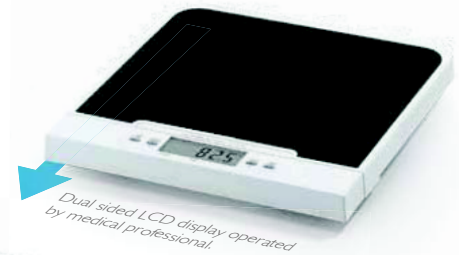
Dual sided LCD display operated by medical professional.