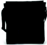
ST-3571 Optional carry bag