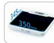
Flat construction makes stepping on easy and safe.