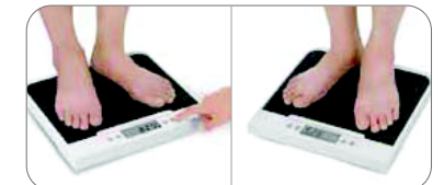
Measures baby under 20kg by 10g and automatically switch to adult mode above 20kg by 100g.