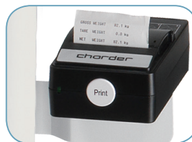
Thermal printer prints results record for patient reference