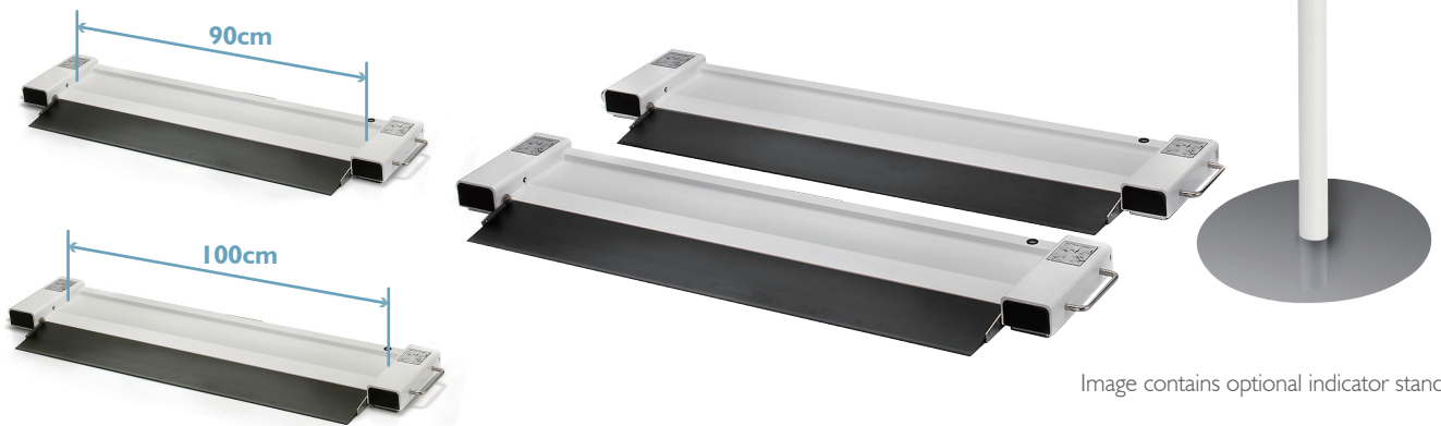
Image contains optional indicator stand

Results can be viewed on the easy-to-read color touchscreen and transmitted wirelessly to EMR systems, for a more streamlined and efficient measurement process.