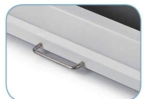
Handles for portability