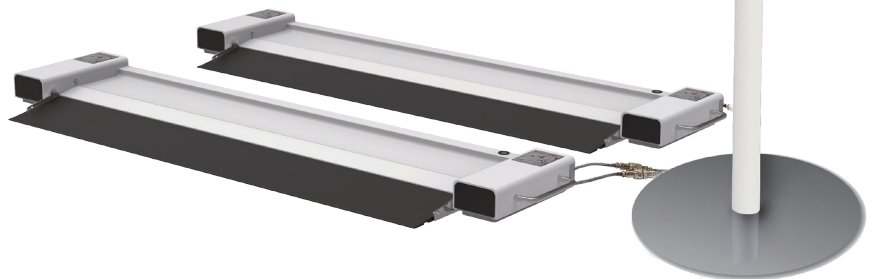
Image contains optional indicator stand