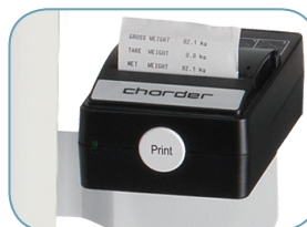
Thermal printer prints results record for patient reference