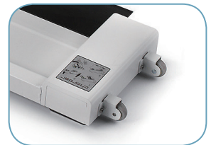
Built-in castor wheels