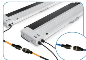
Color-coded connectors for easy installation