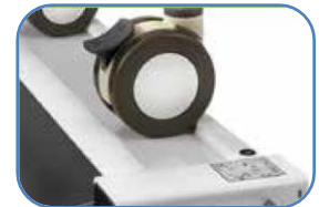
Push bed onto scale via foldable ramps