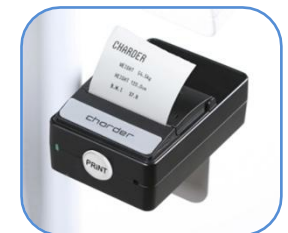
Thermal printer prints results record for patient reference