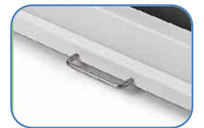
Handles for portability