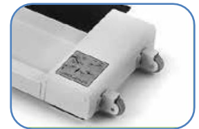
Built-in castor wheels