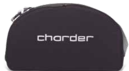
AR-249I Carrying Bag