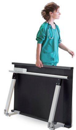
Image contains optional handrail