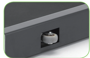
Castor wheels for portability