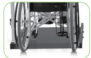
Push wheelchair onto platform via two-way ramps