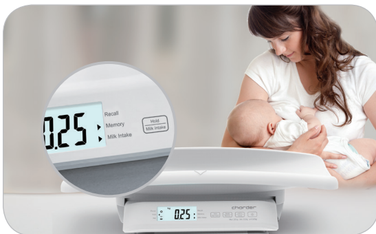
Milk Intake Function