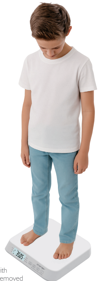
Measure toddlers with measurement tray removed