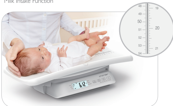
Clear centimeter and inch height markings