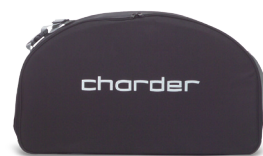
AR-2491 Optional carry bag for baby scale.