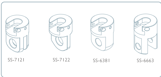
More joints are available