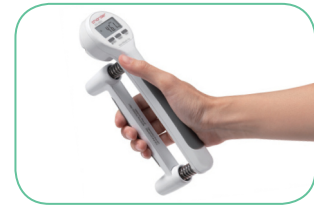
Multiple measurement modes

The dynamometer can be adjusted to different levels of resistance for different individuals. Three modes are available, measuring maximum grip strength, average grip strength, or number of repetitions that meet the selected minimum grip force.