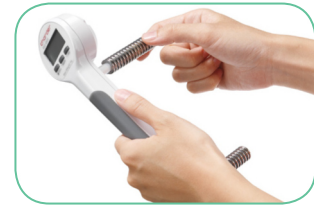
Multiple spring options