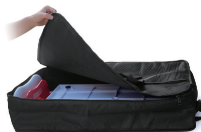
AR-00001 carry bag